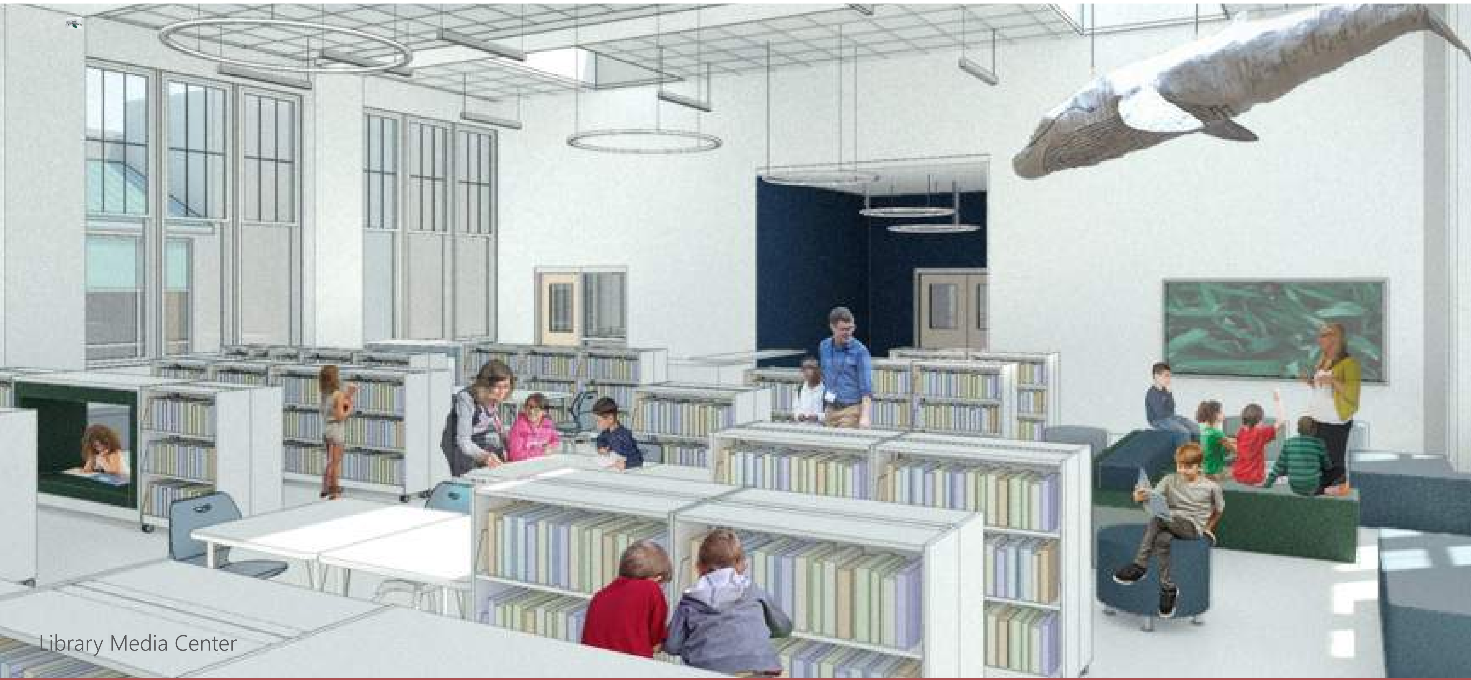
Library Media Center